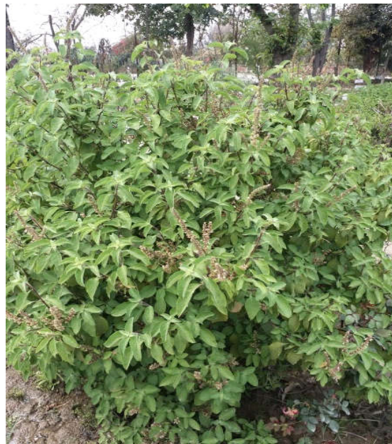
Fig.1: O. kilimandscharicum Guerke grown in medicinal and herbal garden of Pharmacy department, Lovely Professional University, Phagwara, Punjab, India.

Pharmacognostical evaluation was performed on the plant materials that were collected. An evergreen aromatic perennial under shrub, O. kilimandscharicum has simple ovate-oblong leaves, light purple or white flowers, and ovoid-oblong, dark-colored, mucilaginous seeds (Fig. 1). The EO has a strong camphor scent and is a bright yellow liquid.